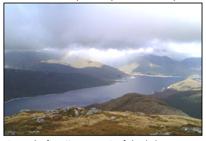
getting to the first Munro summit of the day!

The crossing of the col into Glen Kingie was straightforward enough and we opted to head west up the glen to gain the ridge using the stalker's path, rather that tackling the steep southerly slopes head-on. Although we didn't seem to be going slow it took quite a while to gain the ridge and a strong wind made the going up to Sgurr Beag tougher than it should have been. Our spirits were good however as the views were fine and the last section to Squrr Mor was relatively easy. We finally reached the summit at 16:00, six and half hours after setting out - the longest time I think I've ever spent